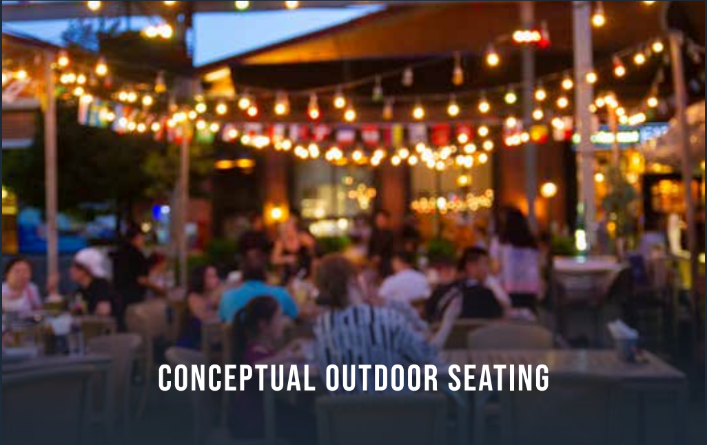
CONCEPTUAL OUTDOOR SEATING