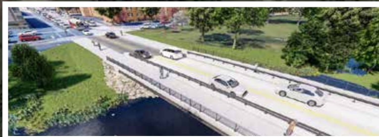
RENDERING: KENILWORTH TERRACE BRIDGE IMPROVEMENTS

DDOT FUNDED NEW BENNING RD CONNECTION TO KENILWORTH AVE (PARKSIDE) TO BE COMPLETED BY Q3 2025