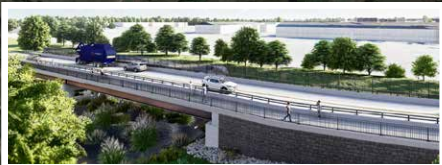
RENDERING: ANACOSTIA AVENUE BRIDGE IMPROVEMENTS