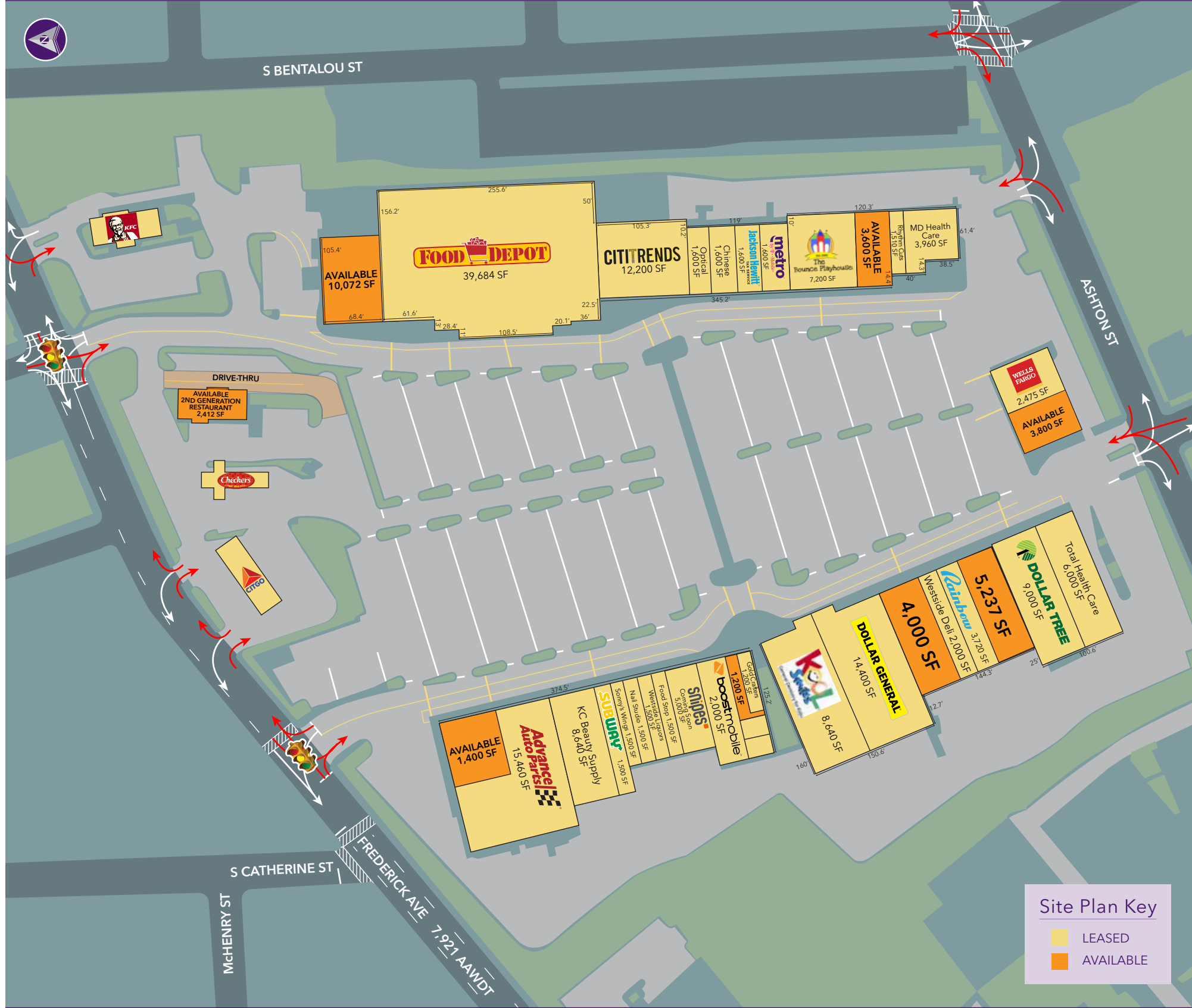
1,400 SF END CAP SPACE