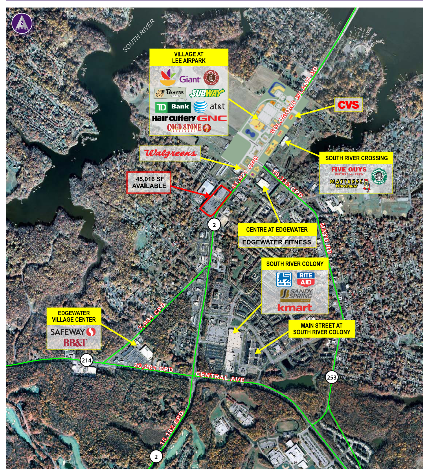
Information herein has been obtained from sources believed to be reliable. While we do not doubt its accuracy, we have not verified it and make no guarantee, warranty or representation about it. Independent confirmation of its accuracy and completeness is your responsibility. H & R Retail, Inc.